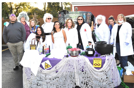
Best District 86 Trunk — Farragut School Mad Scientist Trunk