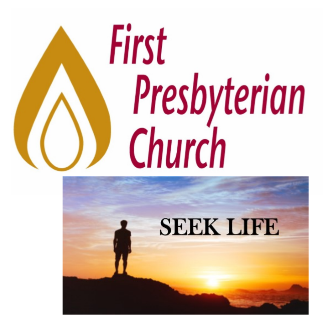
"Seek Life" Sermon Series

We have choices within our reach as we move into 2021. We can move in the direction of what is good and choose to "Seek Life." We do not know all that will unfold, in this new year. The Covid-19 Pandemic is still very much with us, although vaccines are on the way. Political polarization and estrangement are, unfortunately, still a powerful reality. The economy is demanding and there are hardships for too many. Who knows what the surprising developments of 2021 will be, whether they will be good or bad. And of course, we long for something better than 2020.